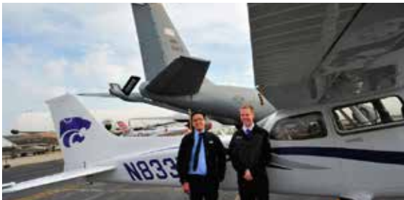
Kansas State University students by their Cessna 172S Skyhawk during the Pancake Feed.